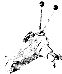
MODEL 40X P.T.O.